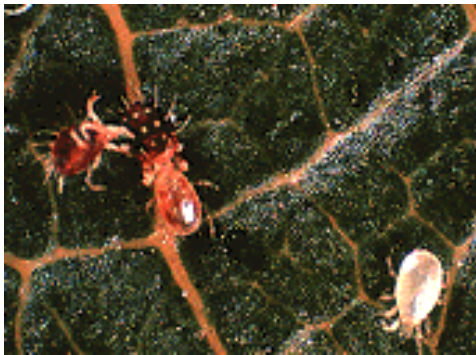
Adult Neoseiulus attacking a European red mite. Note the pale adult in the lower right that has not yet fed. G.Catlin