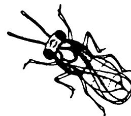
Mature parasite emerges, lives about 10 days.